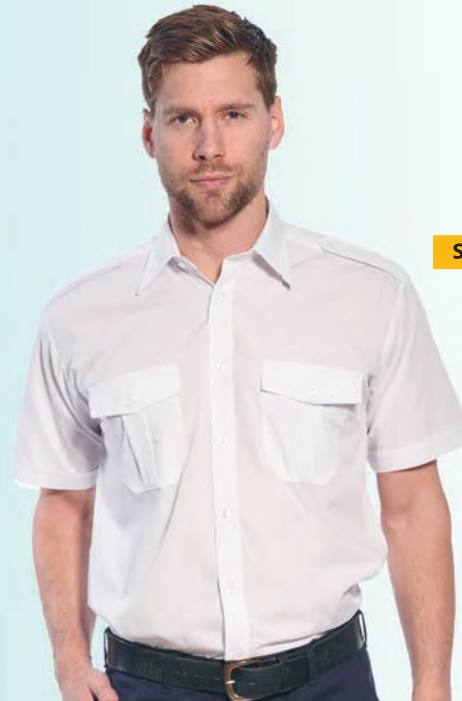
S101 Pilot Shirt, Short Sleeves