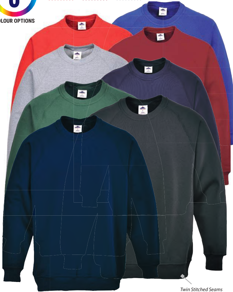
Twin Stitched Seams